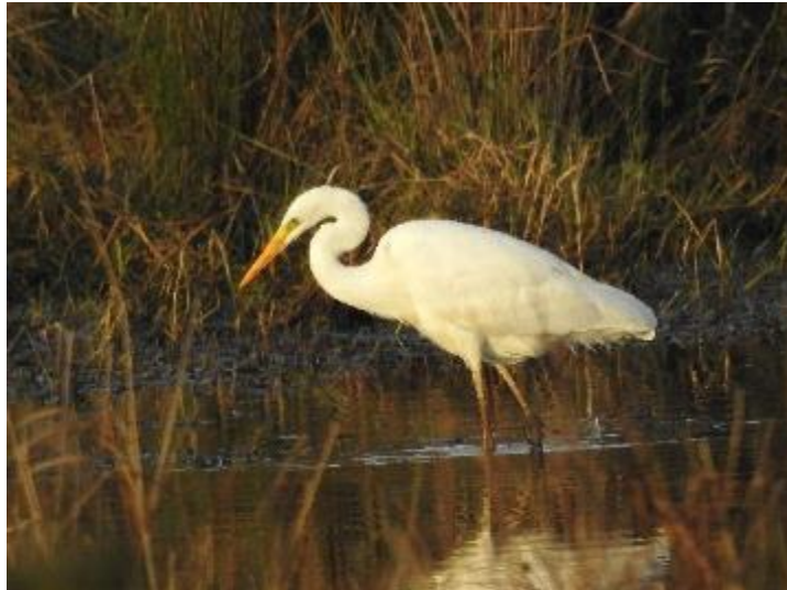
Great White Egret – Roy Clarke