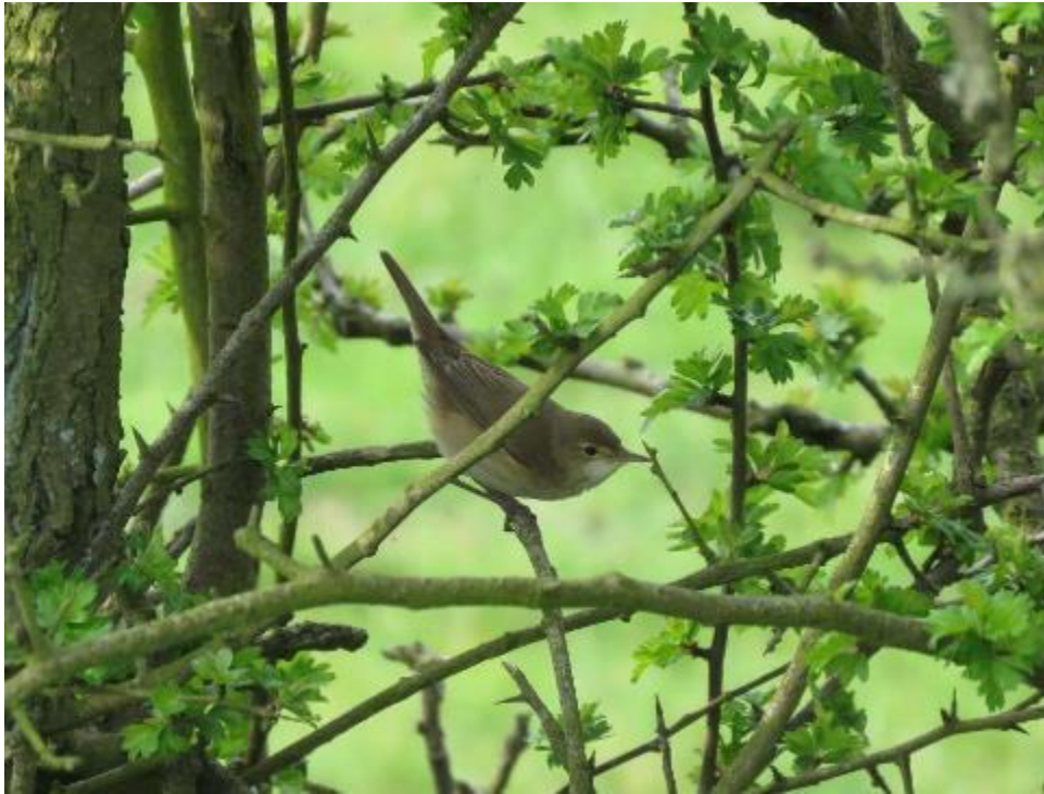
Reed Warbler IR Court