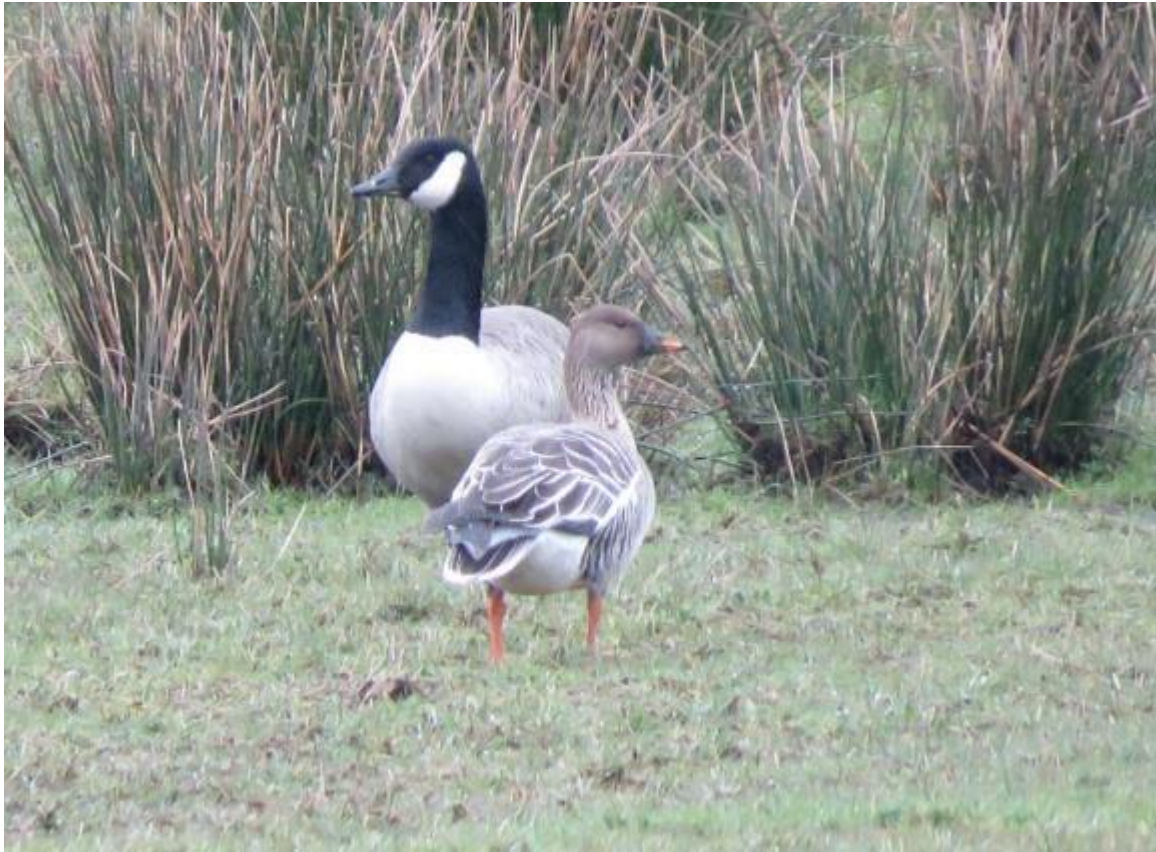
Tundra Bean Goose and Canada Goose. IR Court