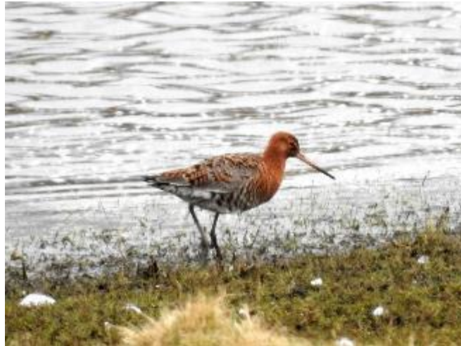
Black-tailed Godwit – Roy Clarke

A colour-ringed bird was present on at least 19th, 25th and 30th March, and 2nd and 8th April. On many occasions the birds were either asleep in a single flock or feeding in the water with the legs not visible, so it is likely that the bird was present between these dates. The bird was ringed on the tibia on both legs with a yellow Darvic above a white Darvic on the left, and a red Darvic above red flag on the right. It had been ringed as a pullus (chick) on 1st September 2009 at A-Barðastrandarsýsla, Reykhólar in north west Iceland. It has subsequently been seen at a number of locations detailed as follows.